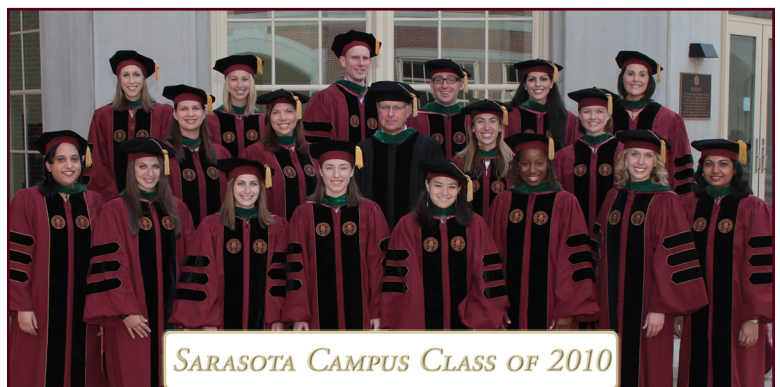
SARASOTA CAMPUS CLASS OF 2010

"Medicine is a wonderful career and offers many exciting and stimulating challenges," he told them. "It offers personal satisfaction and a sense of accomplishment in great measure and will sustain your interest and enthusiasm throughout your lifetime if you let it. I hope at the end of your medical career you will highly recommend your profession to anyone seeking your advice."