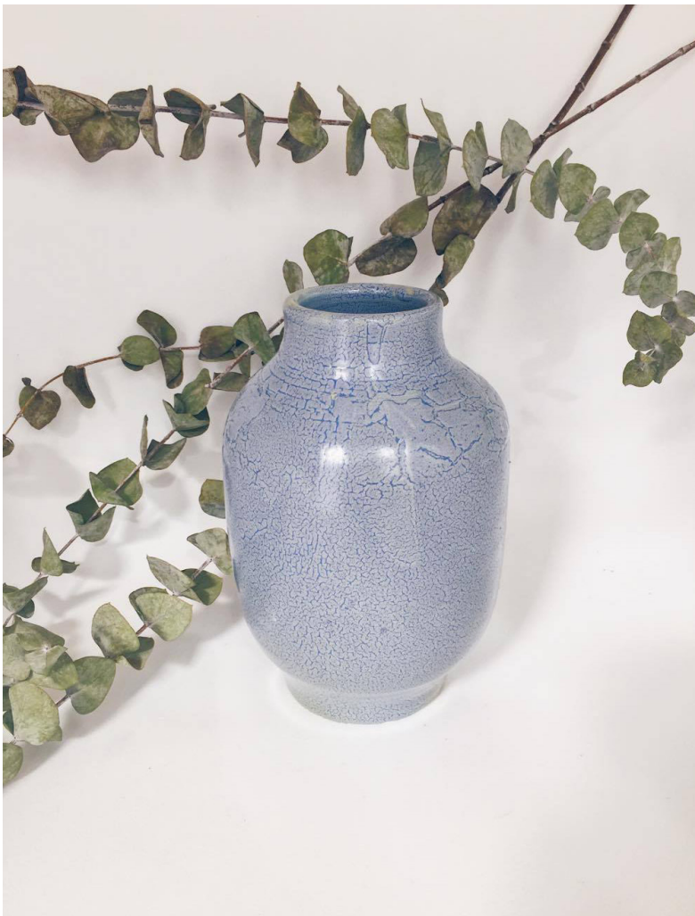
HAND BUILT UTERUS PLATE (TOP) & WHEEL THROWN CERAMIC VASE (BOTTOM)