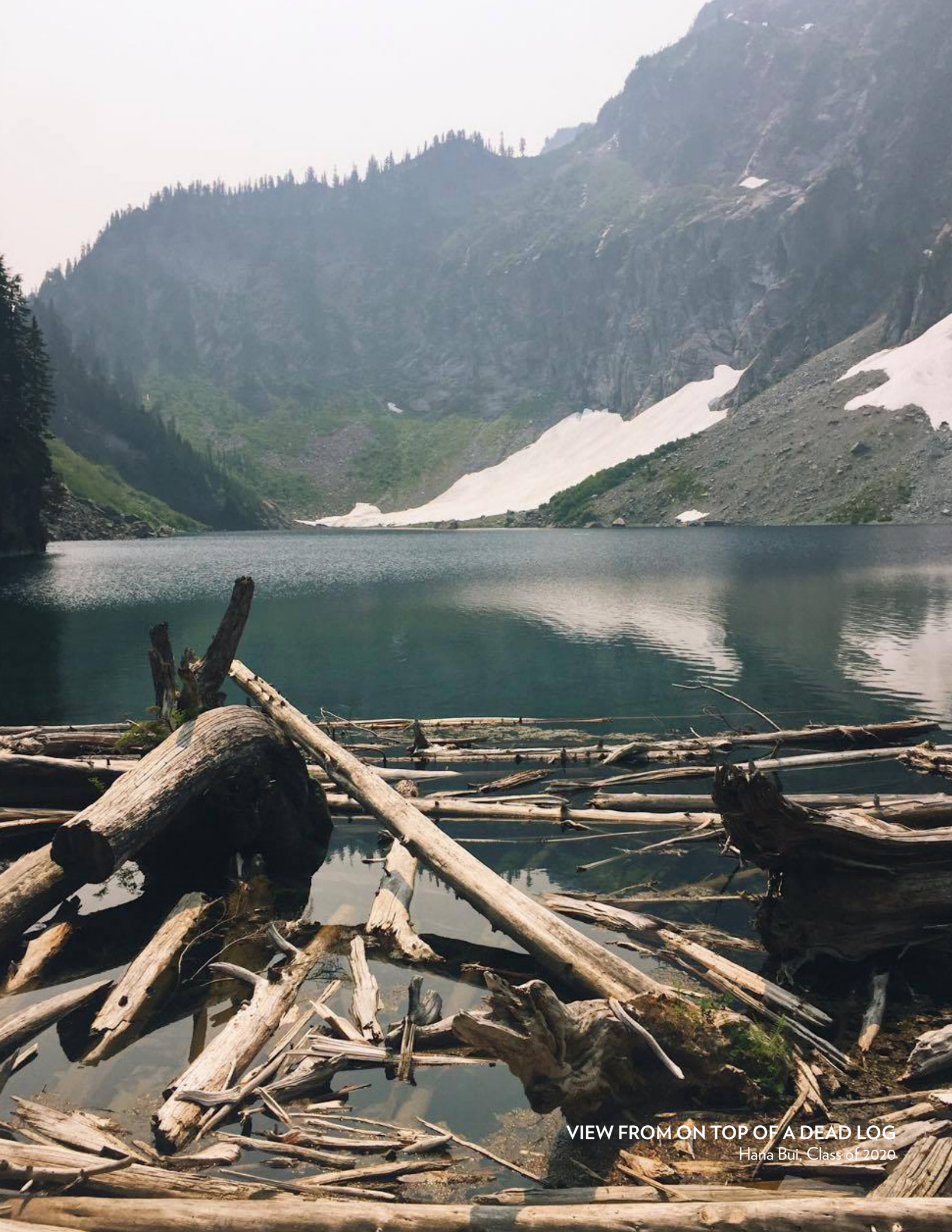
VIEW FROM ON TOP OF A DEAD LOG Hana Bui, Class of 2020