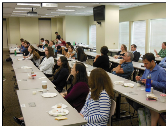
Students, faculty, and staff enjoying Scotus Luncheon Lecture