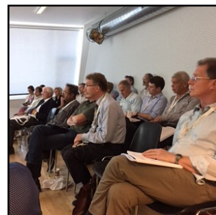
Attendees of 34th Annual Congress on Law and Mental Health, Vienna