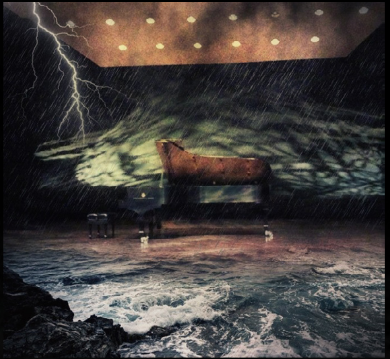
Symphony in Peril Jesse O'Shea, Class of 2015

Please whoever holds us and maintains us together, let us have 5 more minutes, no days. Wait, please, months. What is it you require?