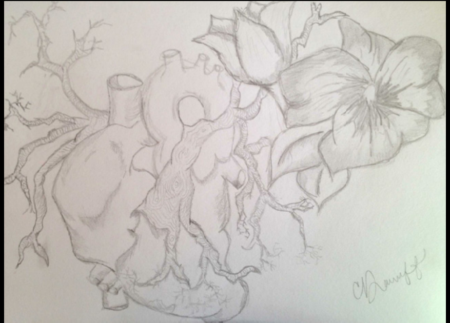
Blooming Life Chanel Davidoff

The air goes still. My arms are extended, reaching out into that precious space where she last was. My fingers are cooling, her warmth leaving. My chest is cold as her tears evaporate. I let my hands fall to my side and they strike with a resounding thud. I collapse to my knees as all around the long grass begins to resume its former shape as the crater slowly disappears. It brushes my ankles and tickles my side. ■